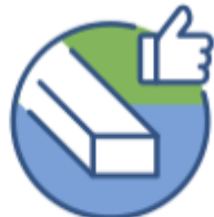
Timber Rot & Woodworm