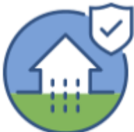
Ground Gas Protection