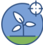
Invasive Weed Control