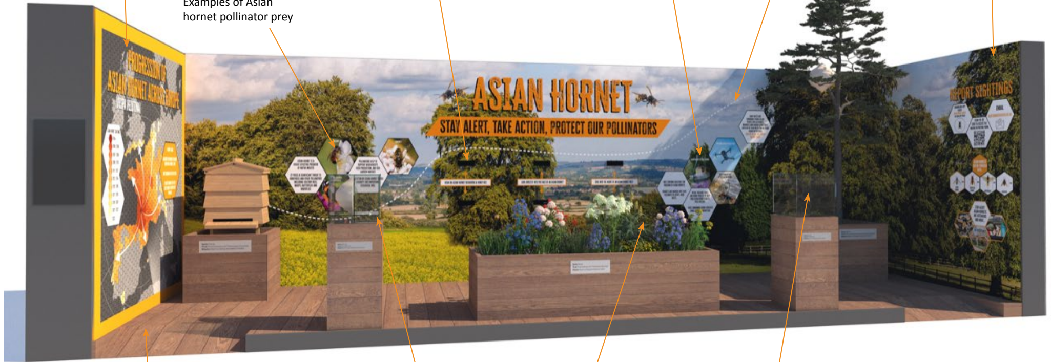
Wheelchair access to exhibit

Learn more about: • How to report sightings • Similar species Asian hornet could be confused with • Ways it can be spread accidentally