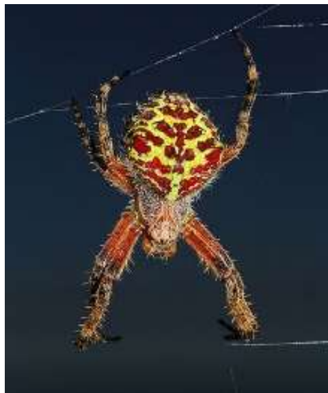
Green spider. Dorsal view

See the Annex for information on the orbweb spiders in the Falklands.