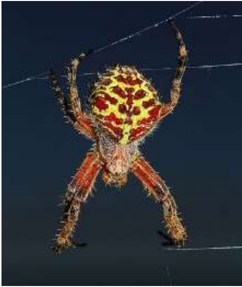
Green spider. Dorsal view