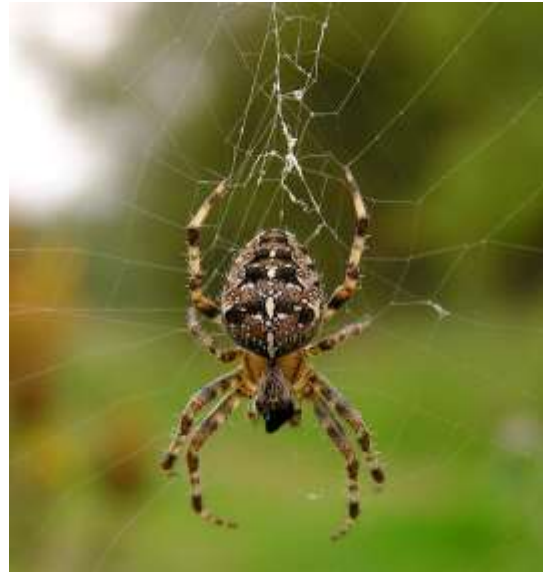
Garden spider. Dorsal view.