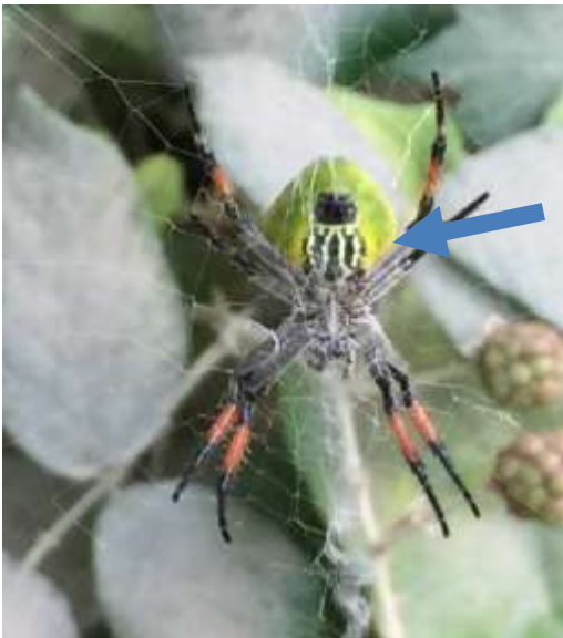
Green spider. Ventral view

Legs are noticeably striped. The spider tends to sit with the legs in pairs, two legs forward and two legs back.