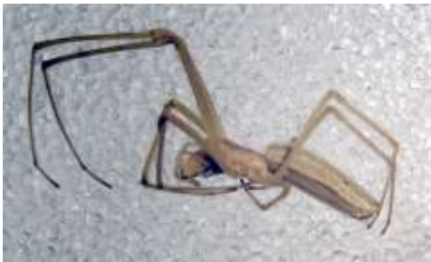
Long-jawed spider