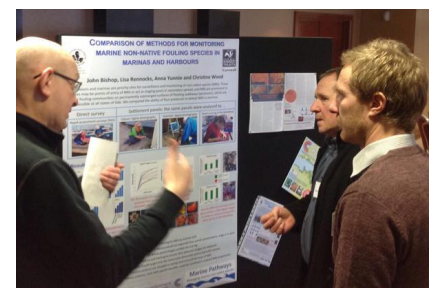
Conference poster session.

Over 70 people attended from across most of the sectors