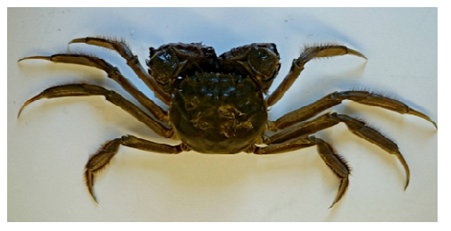
The Chinese mitten crab.

The mitten crab project team held a number of outreach events with both the commercial and