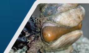
Ewinedd moch Slipper limpet