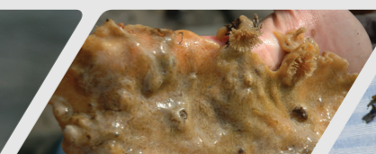
Chwistrell fôr carped Carpet sea squirt