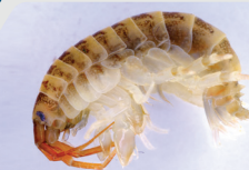
Misglen Quagga Quagga mussel