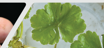
Dail-ceiniog arnofiol Floating pennywort