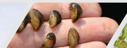
Perdysen Reibus Killer shrimp