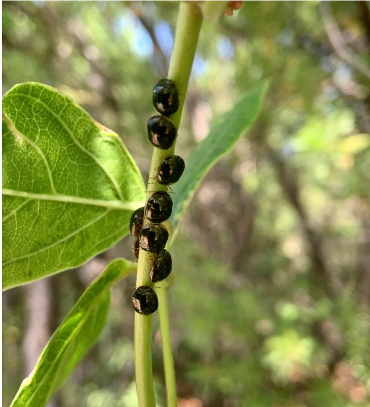
Brachyplatys subaeneus (Westwood) Black bean bug

Black bean bugs suck nutrients from plants. Females produce 300-400 eggs, laid over a period of several months on the plants. Nymphs and adults tend to aggregate on stems or on petioles under leaves. Black bean bugs show a clear preference for Fabaceae (legumes)