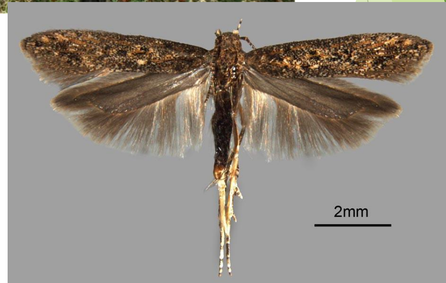
Tuta absoluta -a horizon scanning species