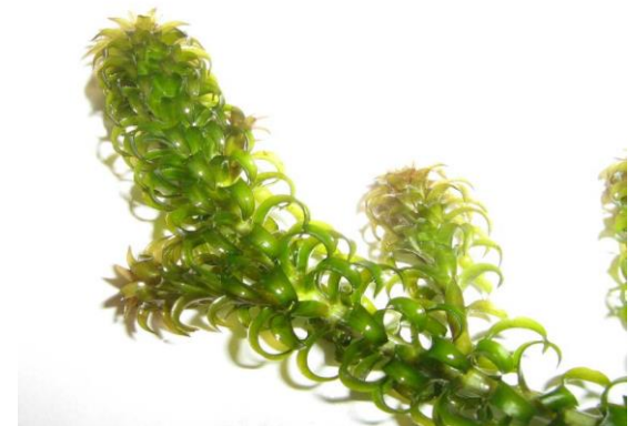
British Waterways and RPS Group plc