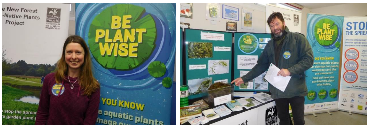
The event on 10 February 2018 focussing on the restoration of Hatchet Pond was a good opportunity to promote the Be Plant Wise campaign and the Check, Clean, Dry campaign to local residents, naturalists and fishermen