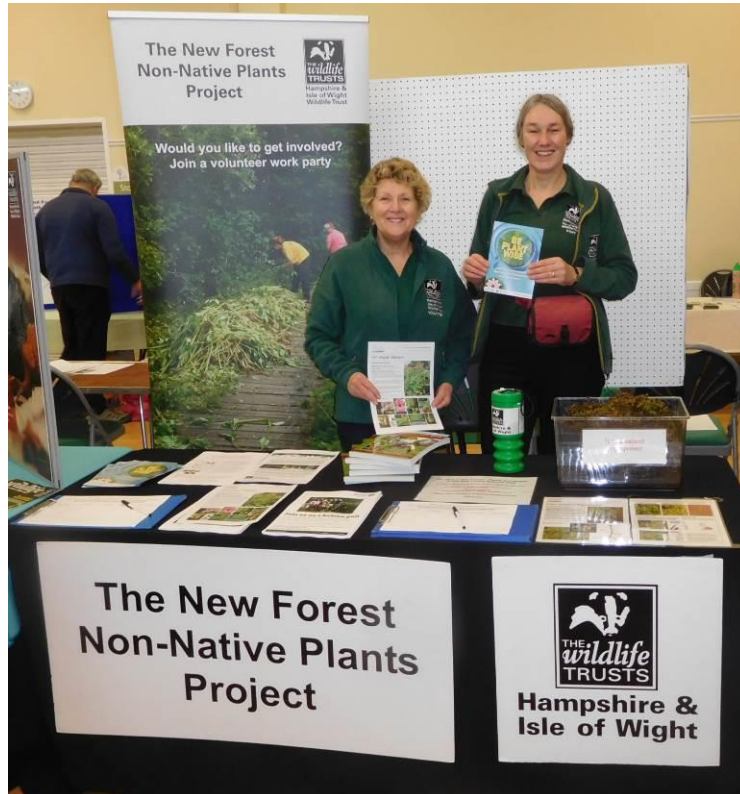
The Volunteer Fair at Lyndhurst on 28 January 2018 was a good opportunity to promote the Be Plant Wise campaign