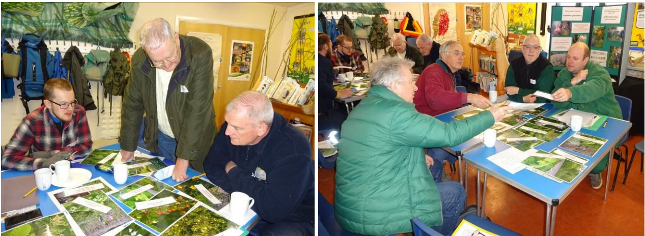
Some of the participants identifying invasive non-native plants during the awareness-raising session for Parish Councils and Town Councils on 1 March 2018