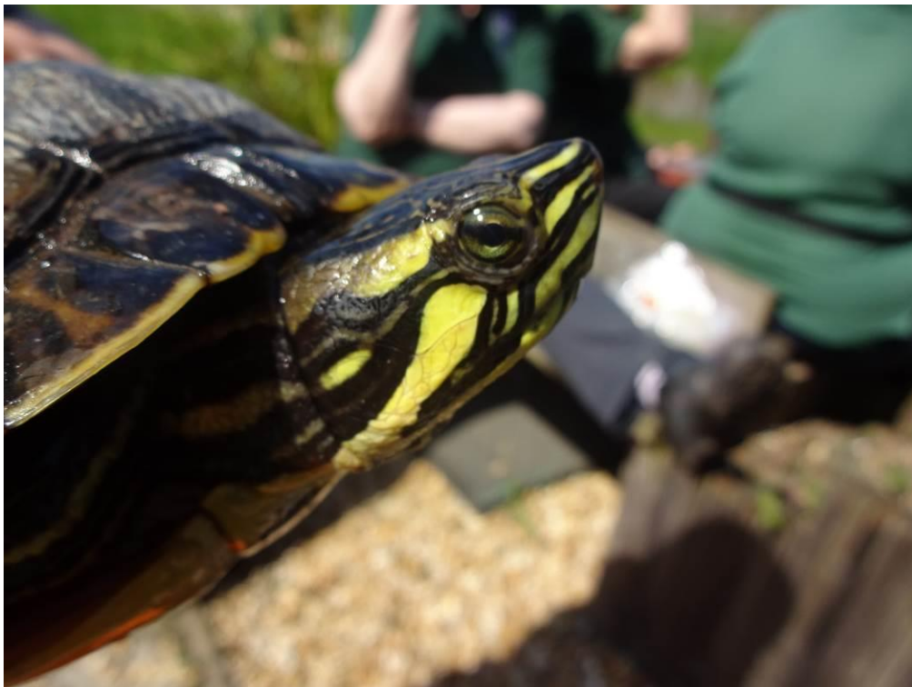
Non-native terrapin found at Testwood Lakes on 19 April 2018