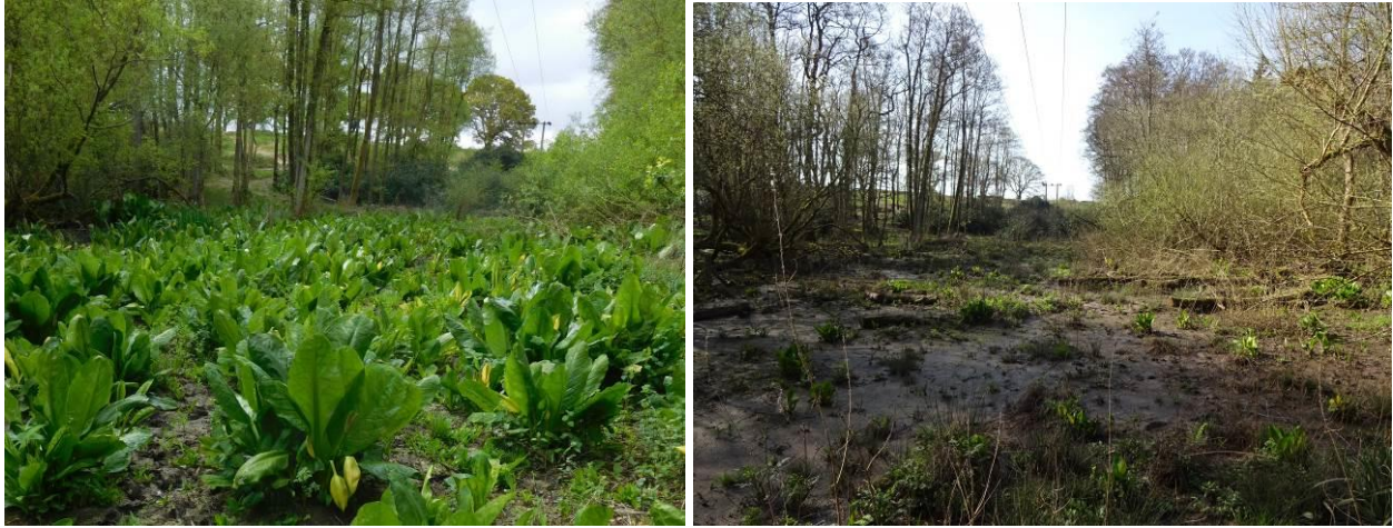
Photograph on left taken on 26 April 2017; photograph on right taken on 18 April 2018

On 18 April 2018 Jo and Catherine visited Harcourt Wood to monitor the effectiveness of the herbicide treatments undertaken in 2017 to control American skunk cabbage. A substantial decrease in the density of American skunk cabbage plants was observed in the 'open' part of the site beneath the overhead wires, as indicated in the photographs below:-