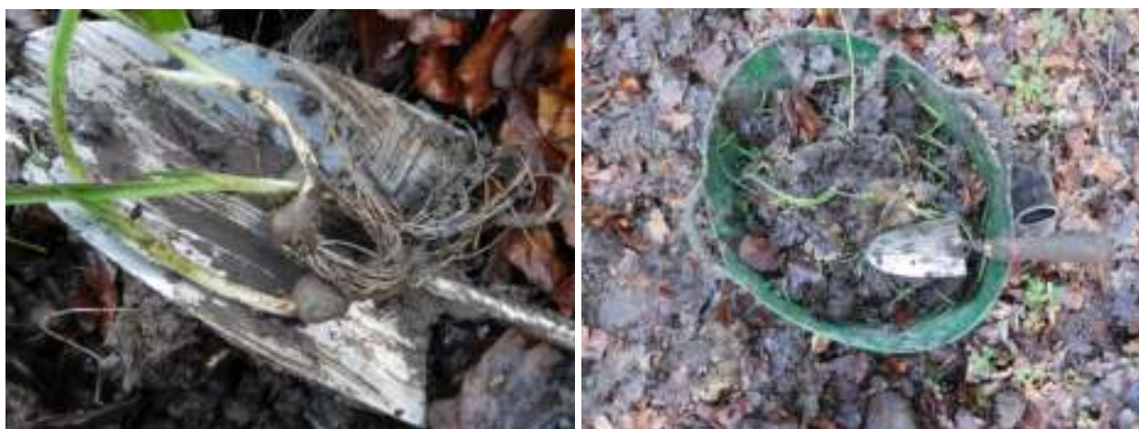
Three-cornered leek Allium triquetrum dug up from verge along Fletchwood Lane between SU 33421 11260 and SU 33437 11272 on 13 January 2017

All plants found were removed on 13 January 2017.