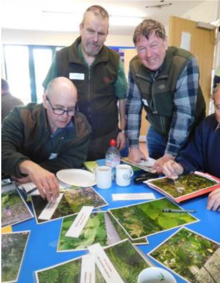
Identification of invasive non-native plants on 9 March 2017