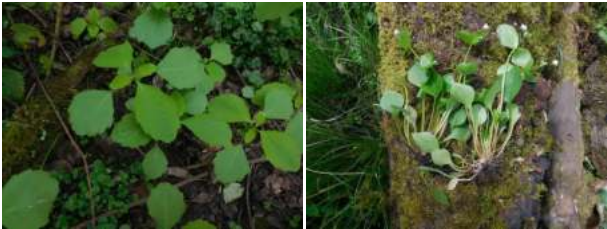
Orange Balsam Impatiens capensis (left) was recorded in Harcourt Wood near Minstead, in vicinity of the Fleet Water, on 26 April 2017 and Pink Purslane Claytonia sibirica (right) was recorded and pulled up in Lymington Reedbeds Nature Reserve at SZ 32144 97032 on 25 April 2017