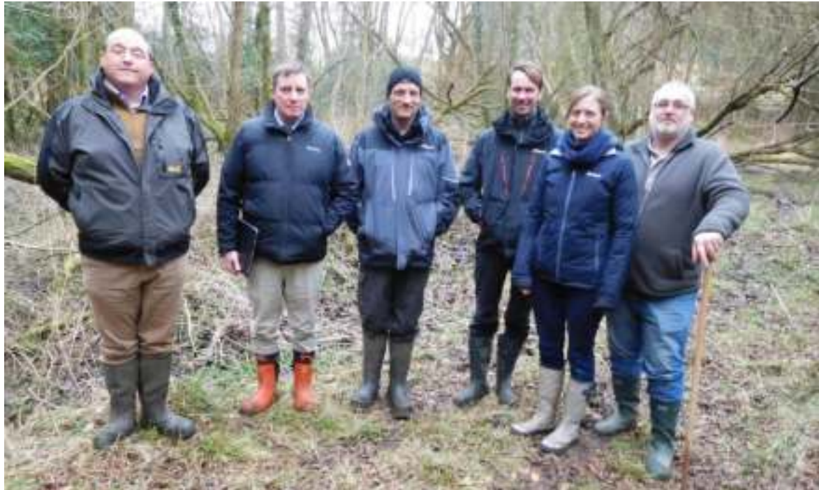
Potential contractors during site visit to Harcourt Wood on 14 February 2017

During early March 2017 the contractors were appointed to undertake the herbicide treatment. Purchase Orders were issued by the New Forest National Park Authority and contract letters, maps and risk assessments were sent out by NFNNPP.