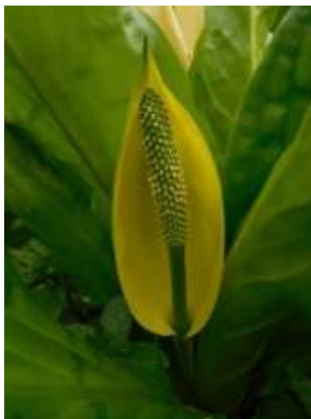
American skunk cabbage flower in Lymington Reedbeds Nature Reserve on 24 April 2017

Jo and Catherine monitored the American skunk cabbage populations within HIWWT's Lymington Reedbeds Nature Reserve on 24 and 25 April 2017. The 6 quadrats installed during 2013 were located and recorded using the DOMIN scale. Locations of American skunk cabbage plants were recorded using a hand-held GPS and the results written up as a file note. Any flowers or developing seed-heads which could be reached were cut or pulled off and removed for disposal off site.