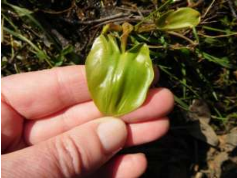
Single plant of bog arum Calla palustris growing along stream near Ipley at grid reference SU 39452 07115 on 26 March 2017