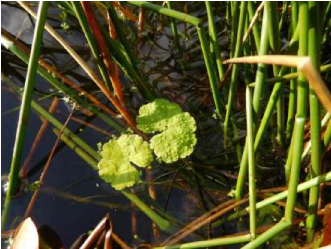
Floating pennywort at Holbury Manor Ponds (SU 42785 03750) on 11 January 2017