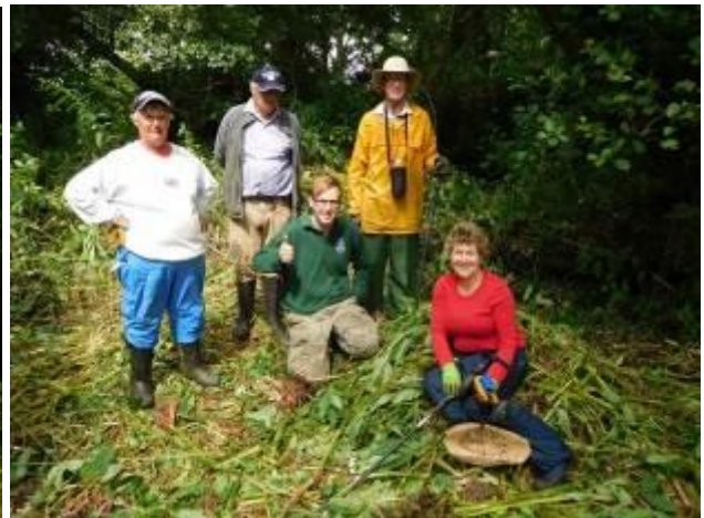
Before.....and after .....balsam pull on the Avon Water on 21 July 2016