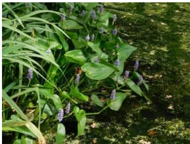
Pickerel weed Pontederia cordata growing on western margin of the 'top' pond at Holbury Manor Ponds on 29 July 2016

On 29 July 2016 whilst visiting Holbury Manor Ponds to look for floating pennywort, Catherine Chatters came across Pickerel weed growing on the margin of the 'top' Pond at SU 42722 03757. The Pickerel weed covered an area approximately 2m x 3m.