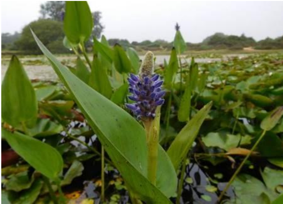
Pickerel Weed Pontederia cordata in small pond at Hatchett on 24 July 2016

Pickerel Weed Pontederia cordata is listed in the 'Field Guide to Invasive Plants & Animals in Britain' by Olaf Booy, Max Wade and Helen Roy (2015). On Sunday 24 July 2016 Catherine and Clive Chatters visited a small pond near Hatchett Pond to locate the Pickerel Weed and assess its population size. The population of less than 100 stems was growing near the margin of the pond at grid reference SU 36601 01195 and covered an area approximately 3m x 1m; there was also a small outlying population of two stems approximately two metres away from the main population. There was a total of six flowering stems at the time of the visit. The Pickerel Weed was growing here amongst white water lily, small yellow water lily and bladderwort.