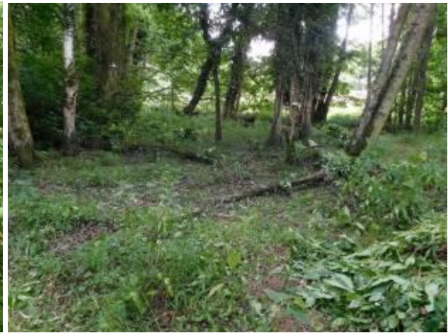
During and after balsam pulling along the Cadnam River on 10 August 2016