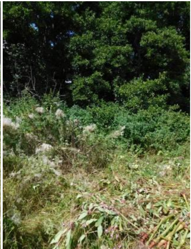
Before and after pulling balsam at Paultons Park on 10 August 2016