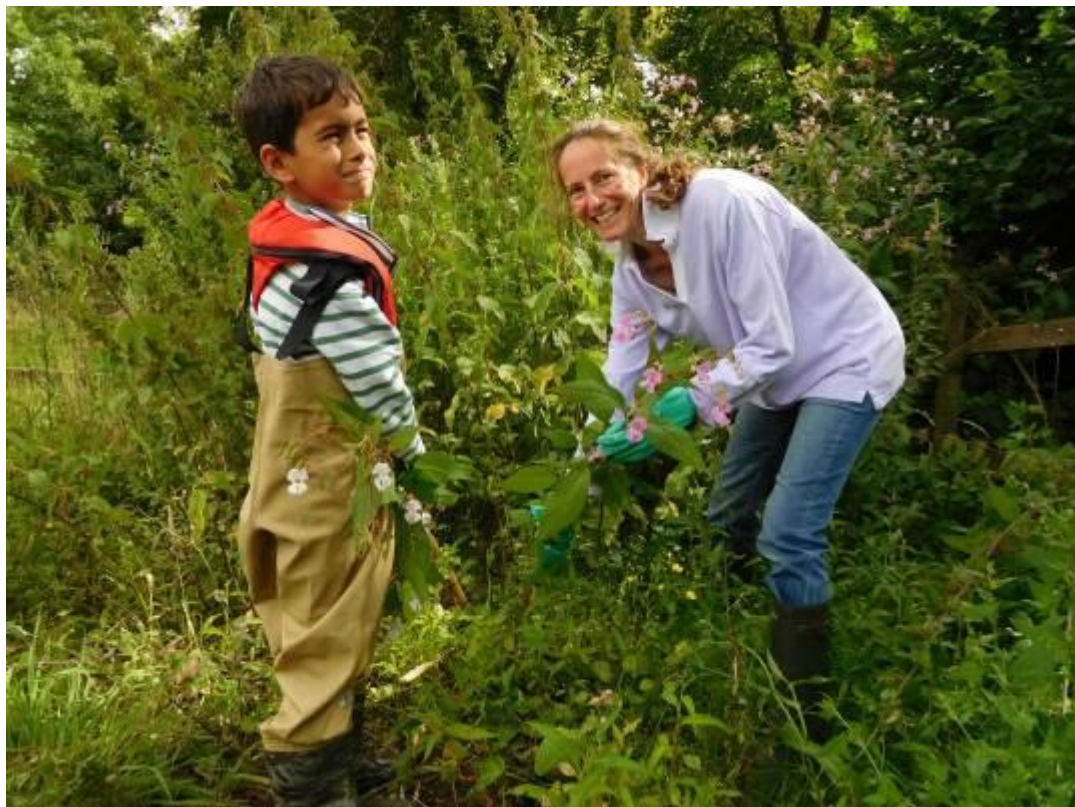
Pulling balsam along the Avon Water on 4 August 2016