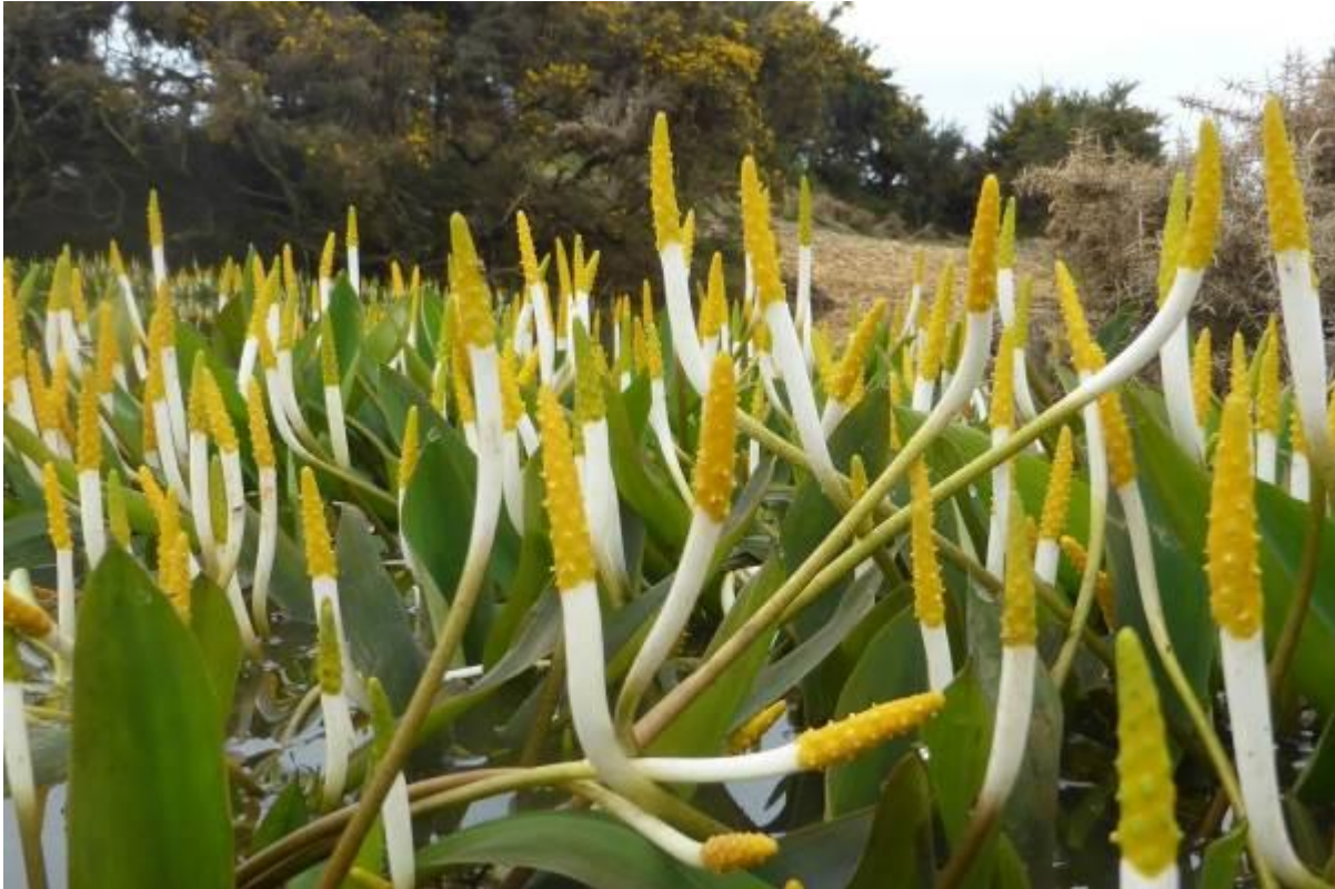
Golden Club Orontium aquaticum near Turf Hill car park.