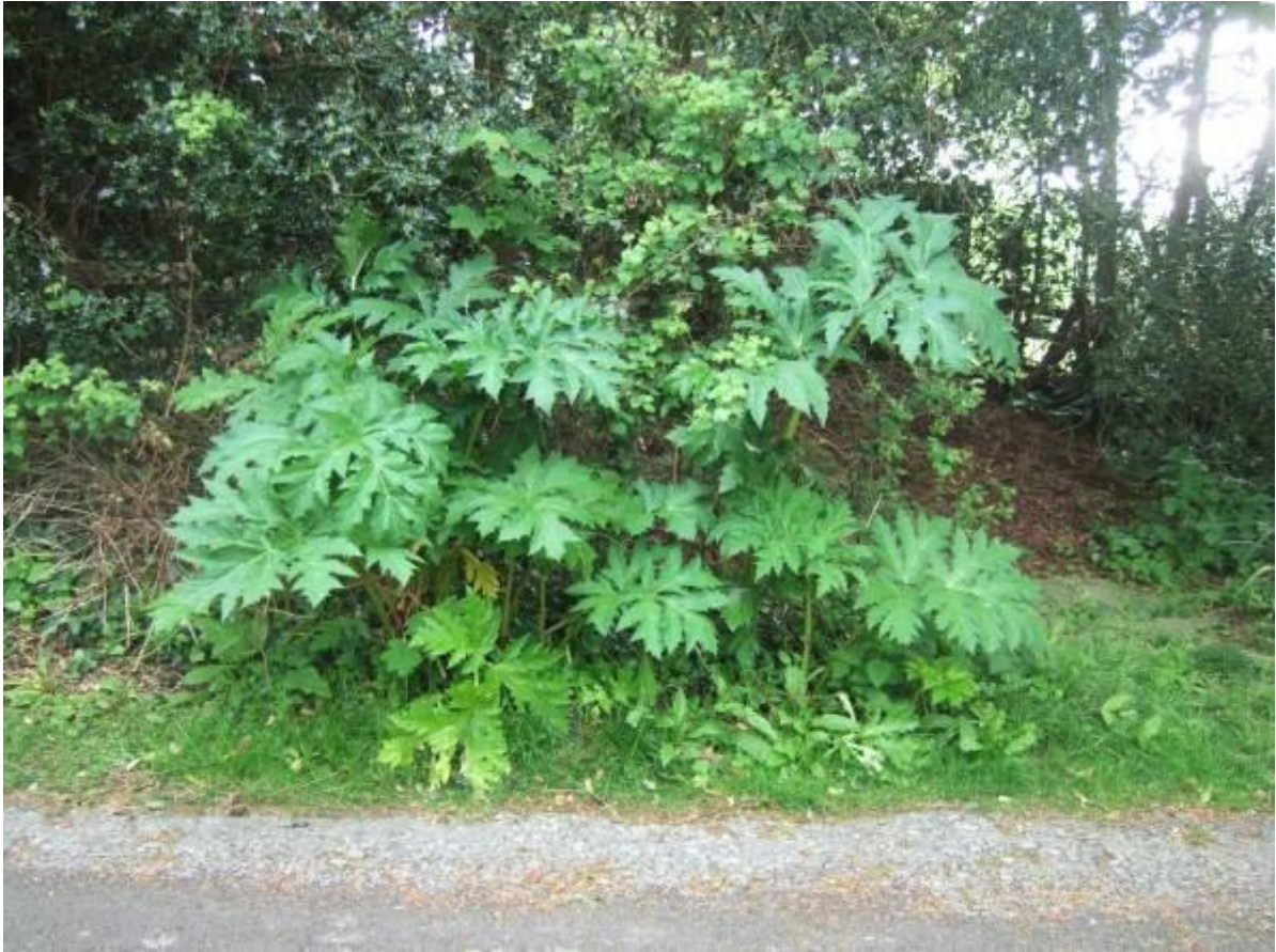
Giant hogweed in road verge along Old Vicarage Lane, Sway on 19 May 2016. Between 30 – 40 stems of giant hogweed were present here.