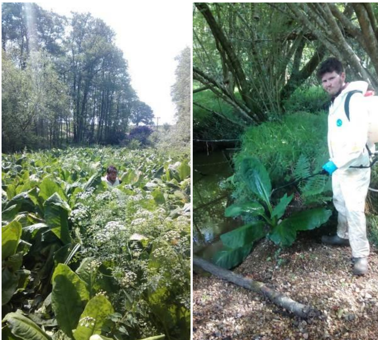
Kingcombe Aquacare Ltd undertook herbicide treatment to control American skunk cabbage in Harcourt Wood during June 2016

The control of American skunk cabbage in Harcourt Wood was completed on 9 June 2016 and the invoice was submitted to the NFNPA.