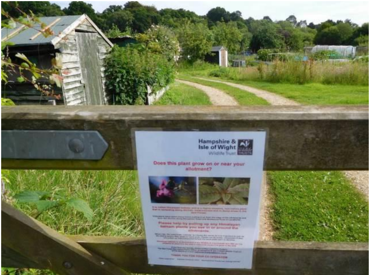
Advisory notice on gate of Lyndhurst Allotments