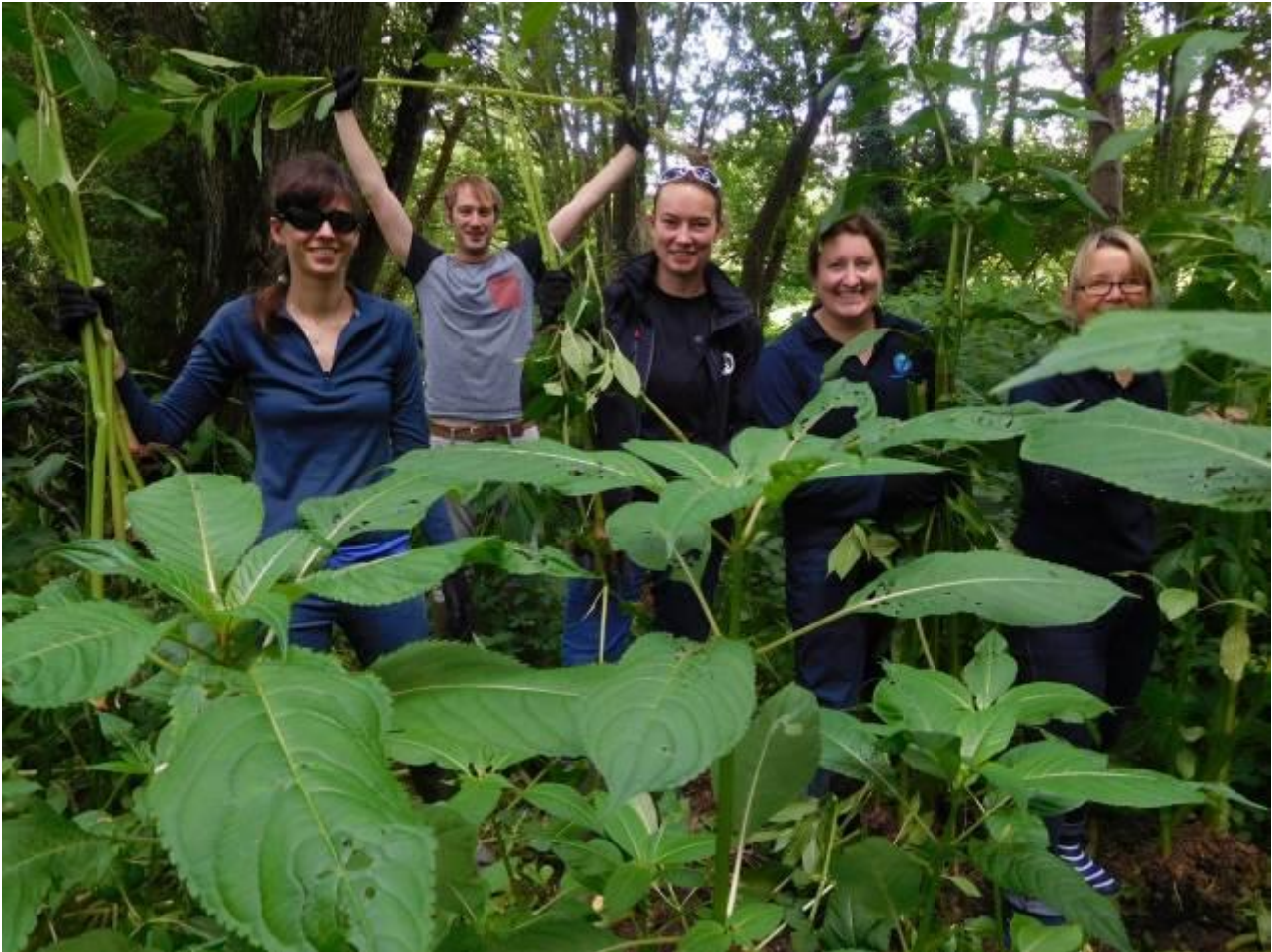
Five members of staff from the Royal Yachting Association joined local volunteers to pull balsam on the Cadnam River at Ower on 14 July 2016