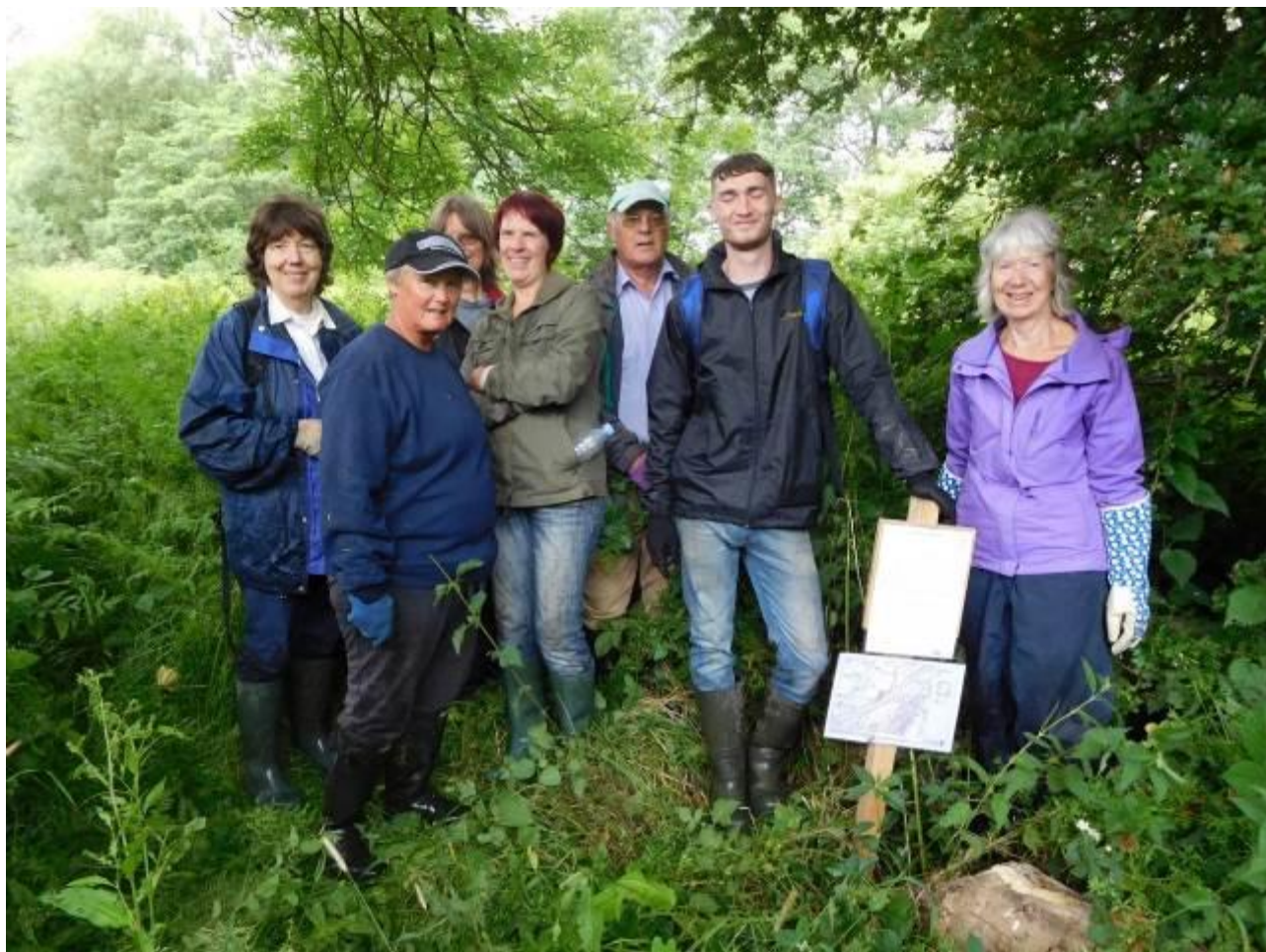
Volunteers ready to tackle the Himalayan balsam on the land subject to the Community Protection Notice on 14 June 2016