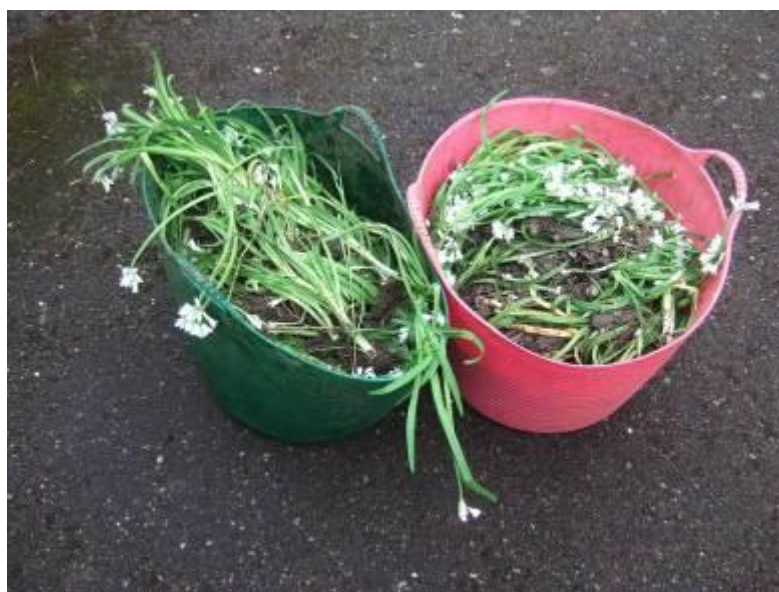
Three-cornered garlic plants dug up from Fletchwood Lane on 11 and 12 May 2016