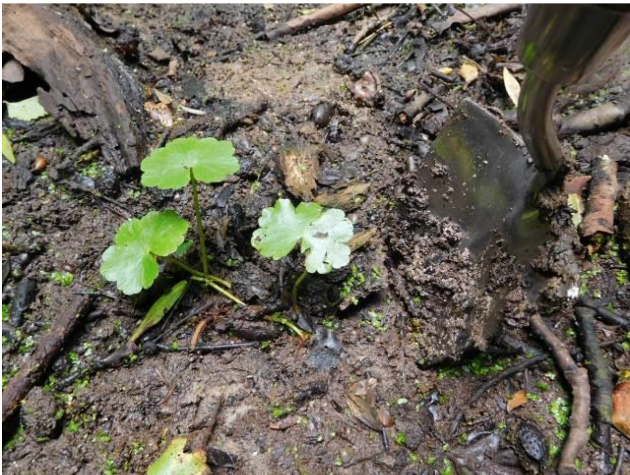
One of the two clumps of floating pennywort Hydrocotyle ranunculoides dug up from the ditch at Holbury Manor Ponds on 29 July 2016