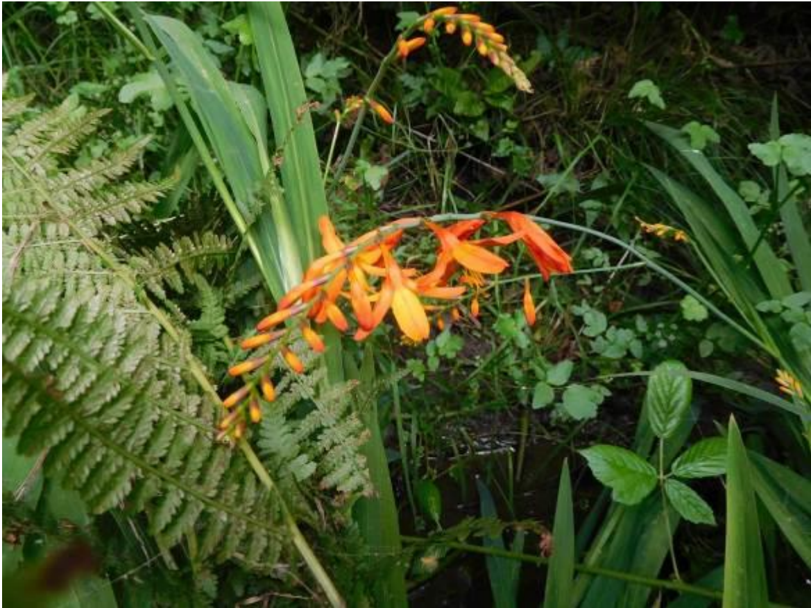
Crocosmia x crocosmiiflora in verge at Park Lane, near Holbury