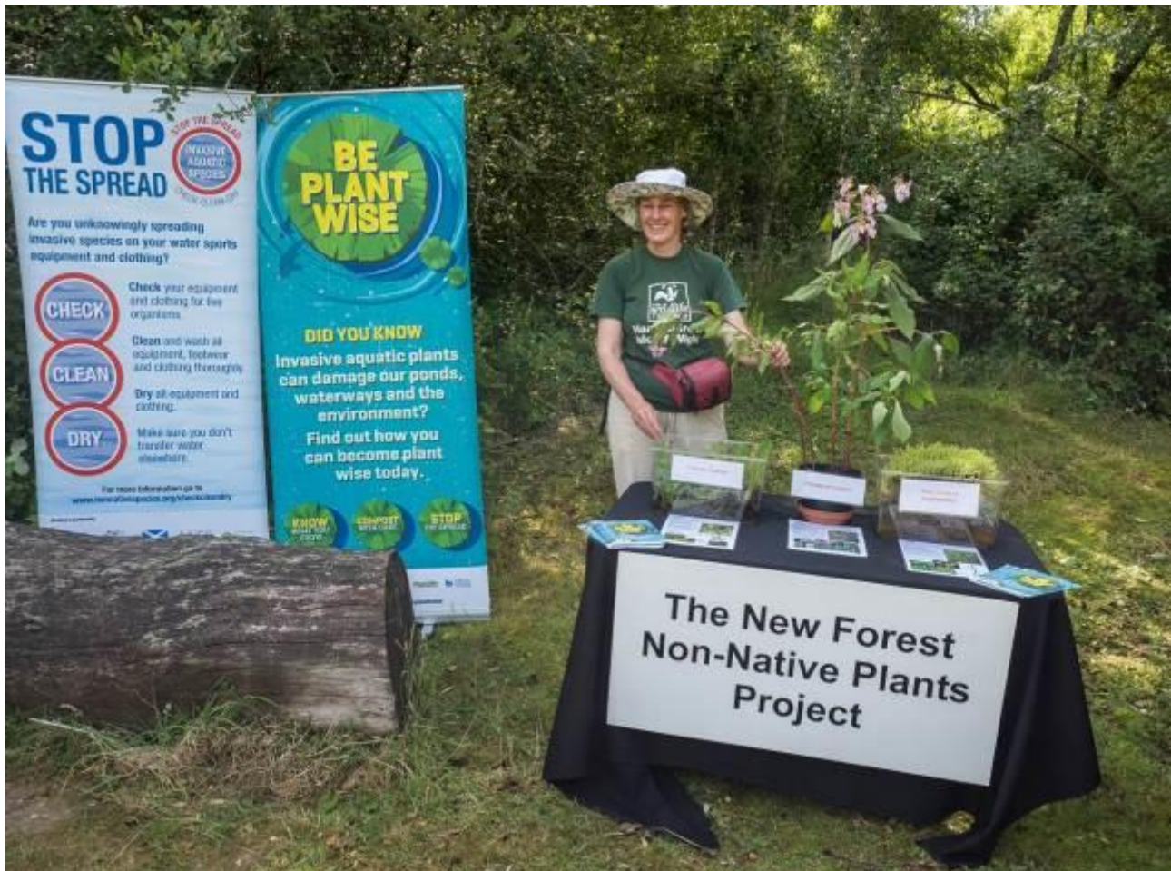
The 'Be Plant Wise' and 'Check, Clean Dry' campaigns were promoted by the NFNNPP to visitors at the 20 th anniversary celebratory event held at Blashford Lakes nature reserve and education centre on 22 July 2016