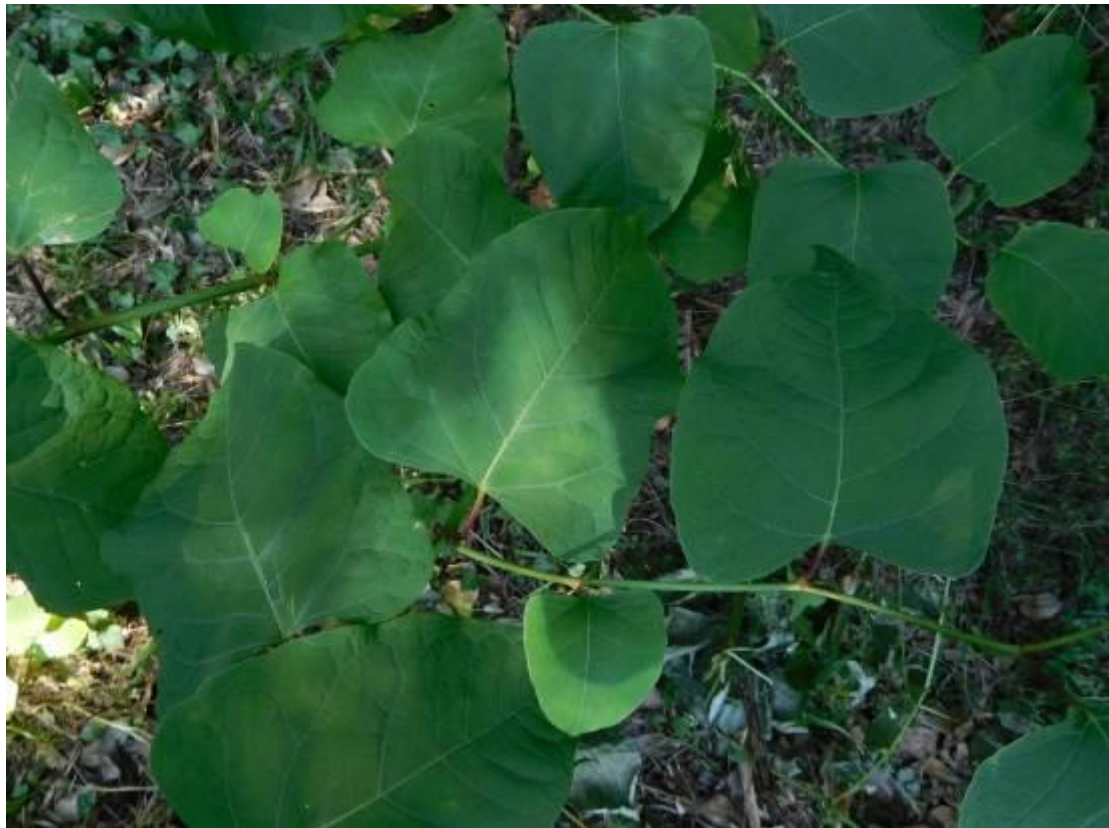
Hybrid knotweed Fallopia x bohémica in road verge near Exbury on 17 August 2016