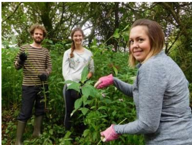
Staff from The Forest Trust on 3 August 2016