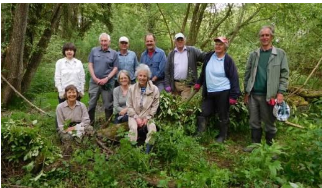
Volunteers at end of balsam pull along the Cadnam River on 24 May 2016