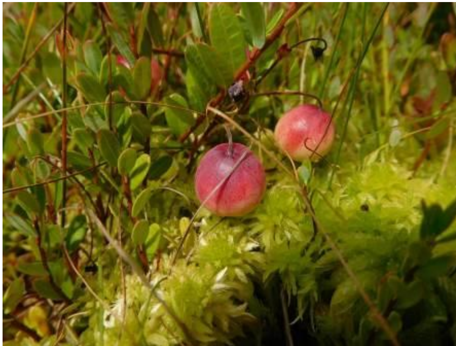
The non-native cranberry Vaccinium macrocarpon growing in species-rich habitats at Two Bridges Bottom on 13 August 2016

Whilst visiting Two Bridges Bottom (SZ 343 997) on Saturday 13 August 2016 to remove Pitcher Plants, Clive and Catherine Chatters came across extensive colonies of the non-native cranberry Vaccinium macrocarpon .