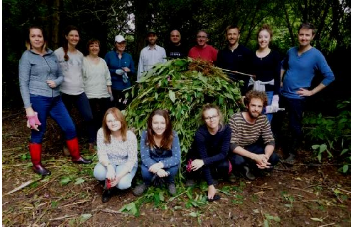
14 members of staff from The Forest Trust pulled balsam along the Cadnam River on 3 August 2016