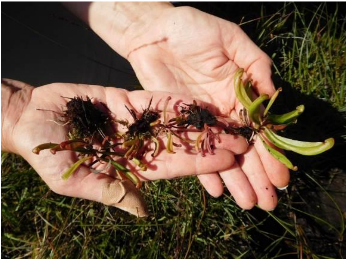
Five of the six Pitcher Plant seedlings dug up from edge of hole at SU 32531 08002 on 15 August 2016