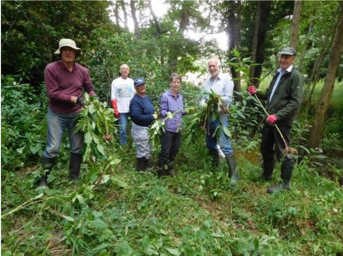
National Trust volunteers pulling balsam at Paultons Park on the Cadnam River on 10 August 2016