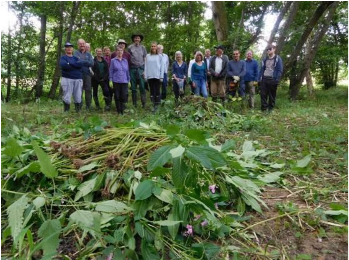
Some of the twenty-four people, including National Trust volunteers, who helped to pull balsam along the Cadnam River on 10 August 2016