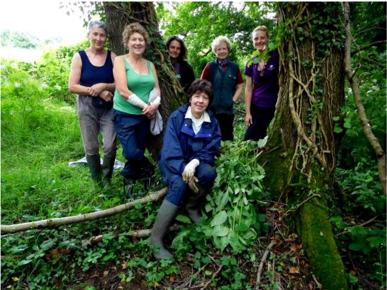
Some of the volunteers at the end of the balsam pull at Ower on 22 June 2016

E-mail from Sophie Lake of the VINE Project who pulled balsam at Ower on 22 June 2016