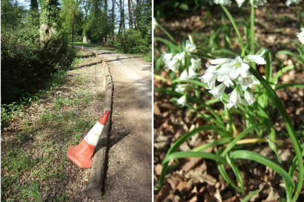
Location of three-cornered garlic Allium triquetrum growing in verge along Fletchwood Lane on 8 May 2016. Over 200 plants were growing between the two traffic cones and four additional clumps were growing further along the verge.

On Sunday 8 May 2016 Catherine discovered over 200 plants of three-cornered garlic Allium triquetrum growing in the road verge along Fletchwood Lane near Totton. This highly invasive non-native plant is listed on Schedule 9 to the Wildlife and Countryside Act 1981. The Estates Bursar of Winchester College accepted Catherine's offer of help to remove the plants. Two tub-trugs were removed by hand on 11 and 12 May 2016.