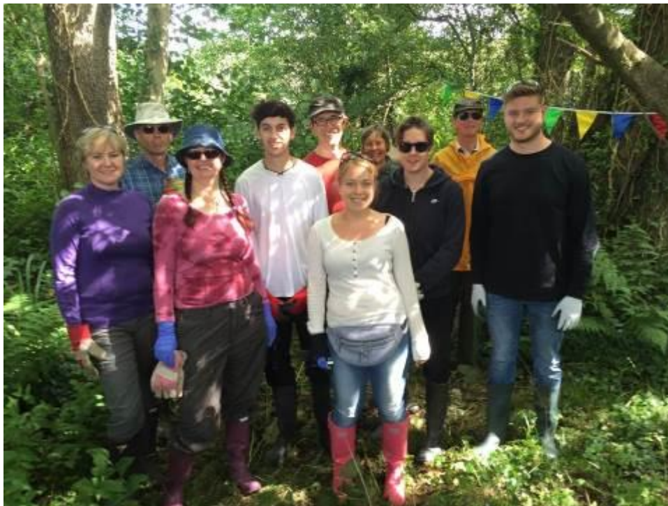
Staff from Ridge & Partners LLP pulled balsam along the Lymington River on 10 August 2016