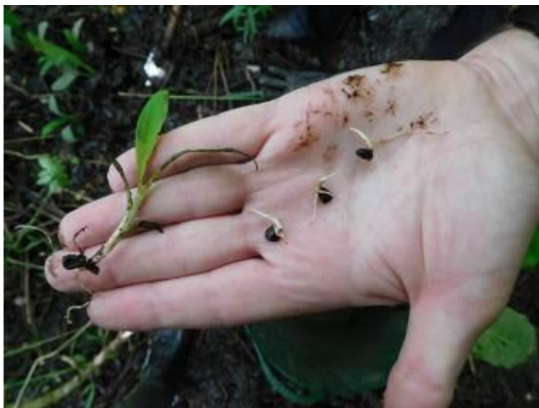
Some of the dozens of American skunk cabbage seedlings dug up from Lymington Reedbeds nature reserve at SZ 32445 96839 on 1 June 2016