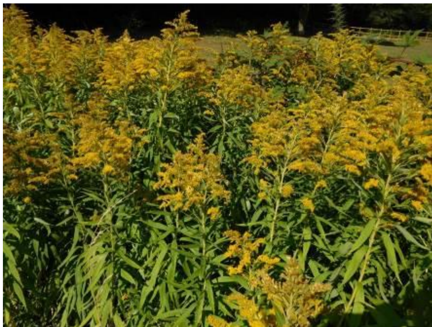
Canadian goldenrod growing in road verge near Longdown on 17 August 2016#

On 17 August 2016 Catherine Chatters noticed Canadian Goldenrod Solidago Canadensis growing in the verge to the east of the road near Longdown for a distance of 15 paces between SU 35828 09387 and SU 35820 09395.