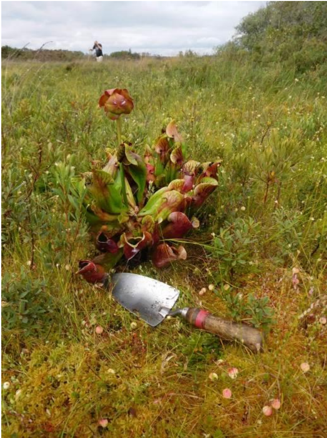
One of the clumps of Pitcher Plants dug up at Two Bridges Bottom on 13 August 2016, with Vaccinium macrocarpon in the foreground