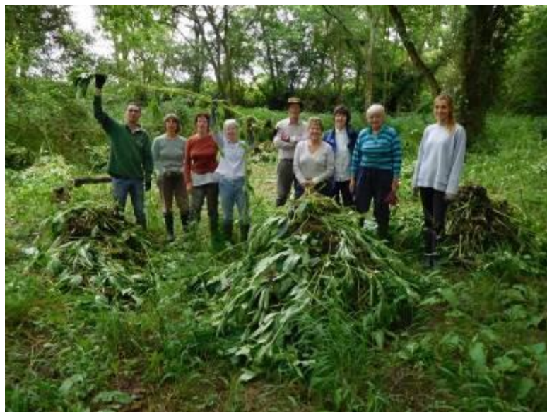
Before, during and after the balsam pull on north bank of Cadnam River at Ower on 7 July 2016