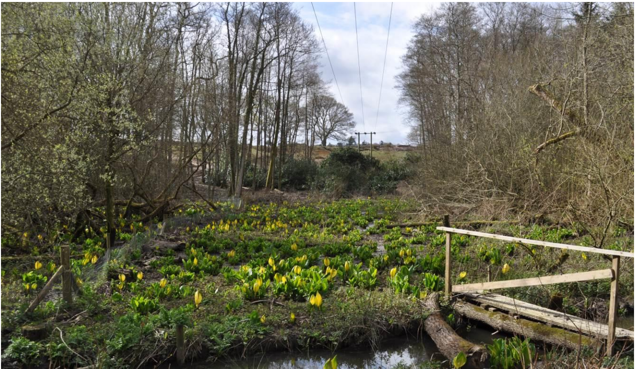
American skunk cabbage in Harcourt Wood on 7 April 2016

The purchase order was issued by NFNPA on behalf of HIWWT to Kingcombe Aquacare Ltd on 29 April 2016 for the control of American skunk cabbage in Harcourt Wood and Catherine Chatters issued the contract letter on the same day.