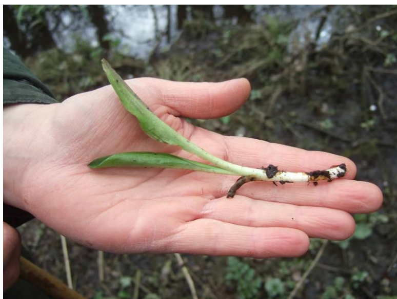
Very small American skunk cabbage plant in Lymington Reedbeds nature reserve on 18 April 2016

On 18 and 26 April 2016 Jo Gore and Catherine Chatters monitored the effectiveness of work undertaken to control American skunk cabbage in HIWWT's Lymington Reedbeds nature reserve. GPS readings were taken to record the grid references of American skunk cabbage plants (or clusters of plants) which will need herbicide treatment in 2016. The six quadrats installed during April 2013 were found and the plant species present were recorded using the DOMIN scale.