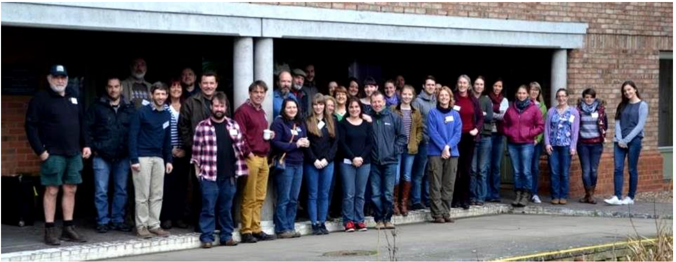
Participants at the GBNNSS workshop in January 2016