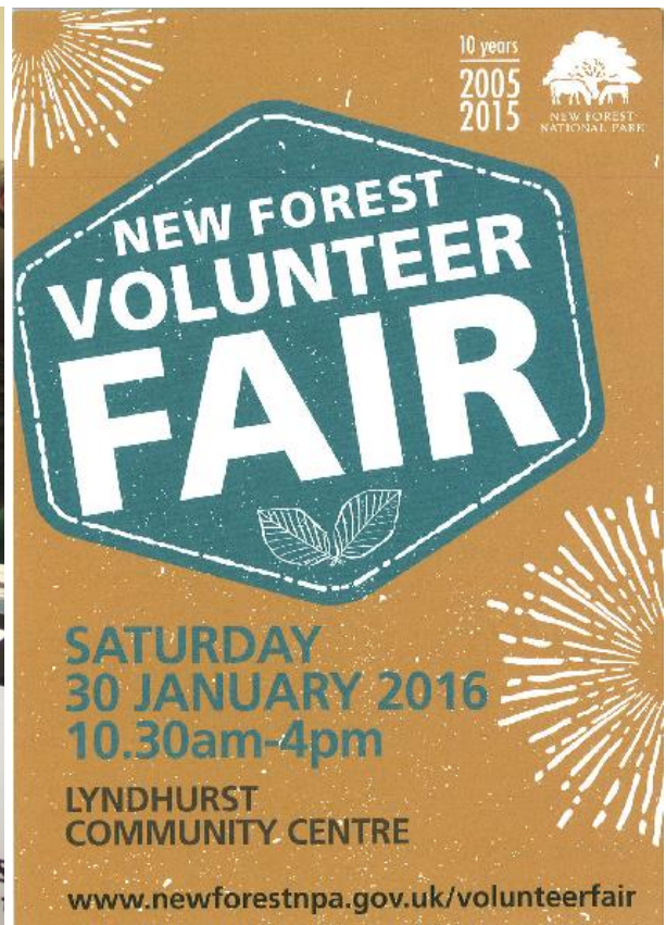
Brian Matthews and Jo Gore at the Volunteer Fair on Saturday 30 January 2016

The Volunteer Guide, handed out to everyone who visited the Volunteer Fair, encouraged people to volunteer with the NFNNPP and included two photographs of children volunteering to pull balsam with the NFNNPP as shown below:-