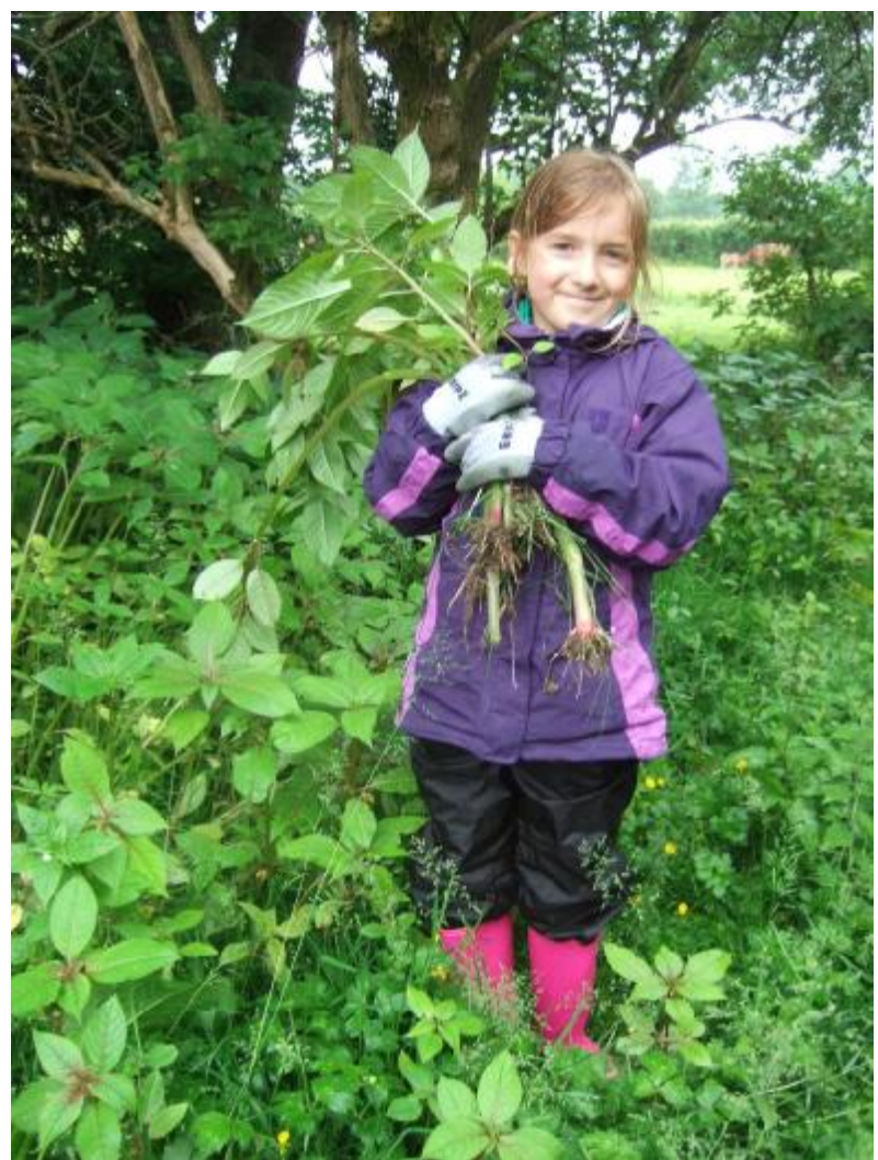
One of the 3<sup>rd</sup> Romsey Cubs who pulled balsam at Southbrook Farm along the Cadnam River on the evening of 27 June 2013