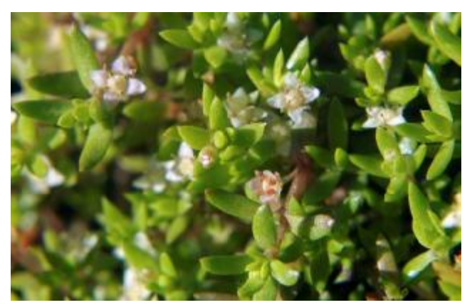
New Zealand pygmyweed