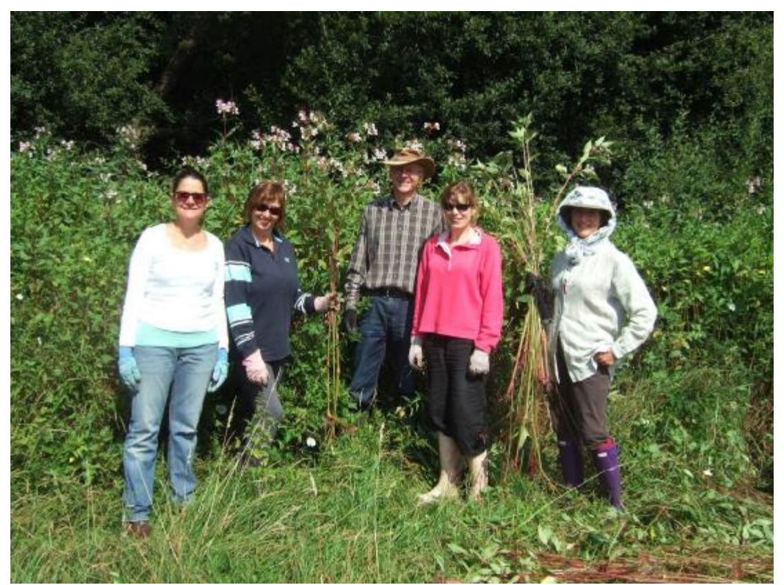
Waitrose partners before.....