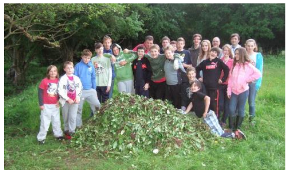
Copythorne Scouts and their leaders at the end of their balsam pull on the Cadnam River on 10 June 2013