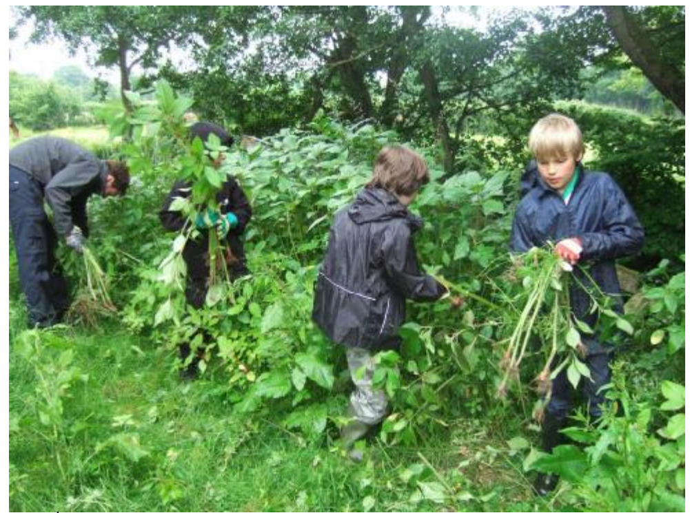
3<sup>rd</sup> Romsey Cubs working hard along the Cadnam River at Newbridge