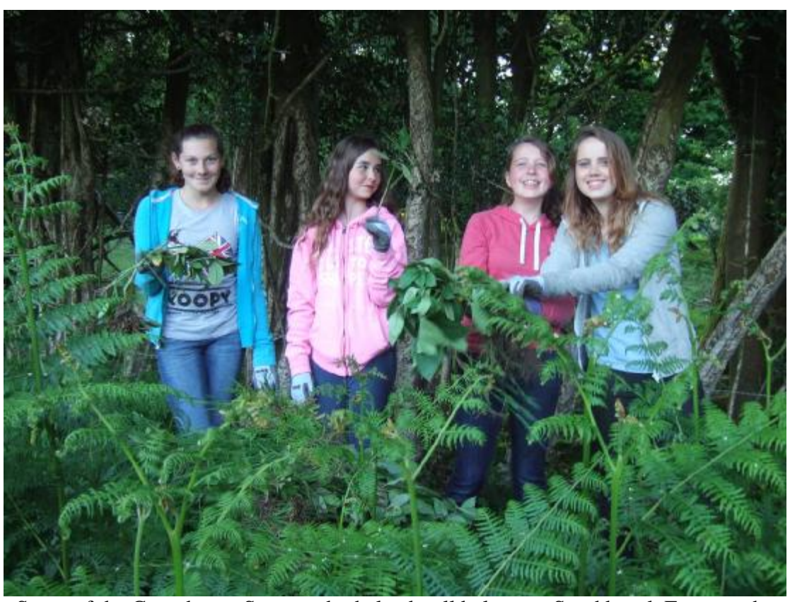
Some of the Copythorne Scouts who helped pull balsam at Southbrook Farm on the Cadnam River on evening of 10 June 2013