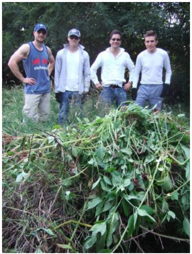
Staff from BMW's Finance Department pulled balsam on the Cadnam River at Southbrook Farm on 22 July 2013