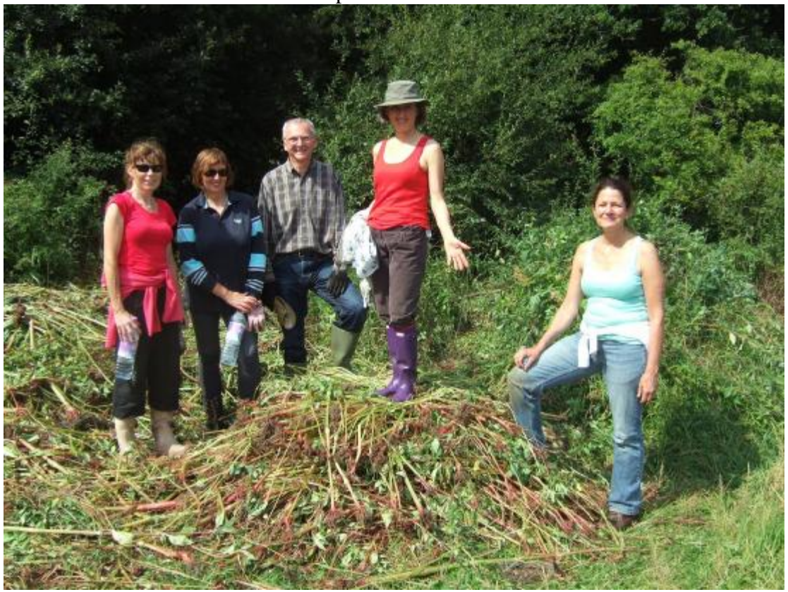
....and after their balsam pull on the Avon Water in August 2013.