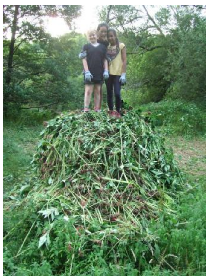
Here some of the Guides from Southampton are standing proudly on the 'mountain' of balsam that they created.