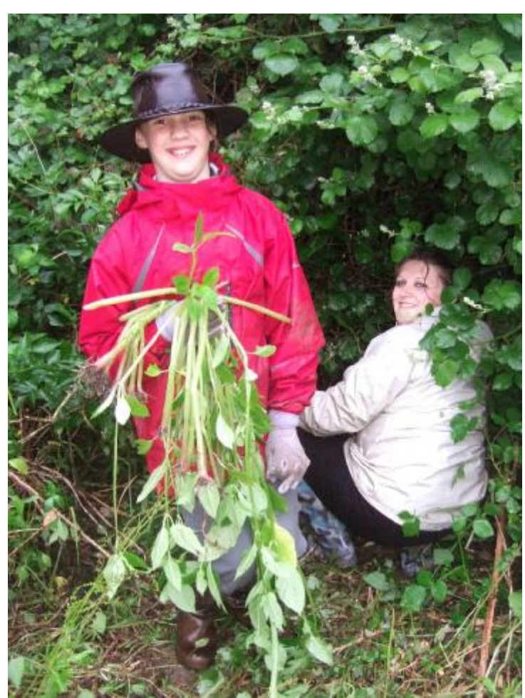
3<sup>rd</sup> Romsey Scouts pulled balsam on the Cadnam River during a rather wet evening on 27 June 2013, but their spirits were not dampened!