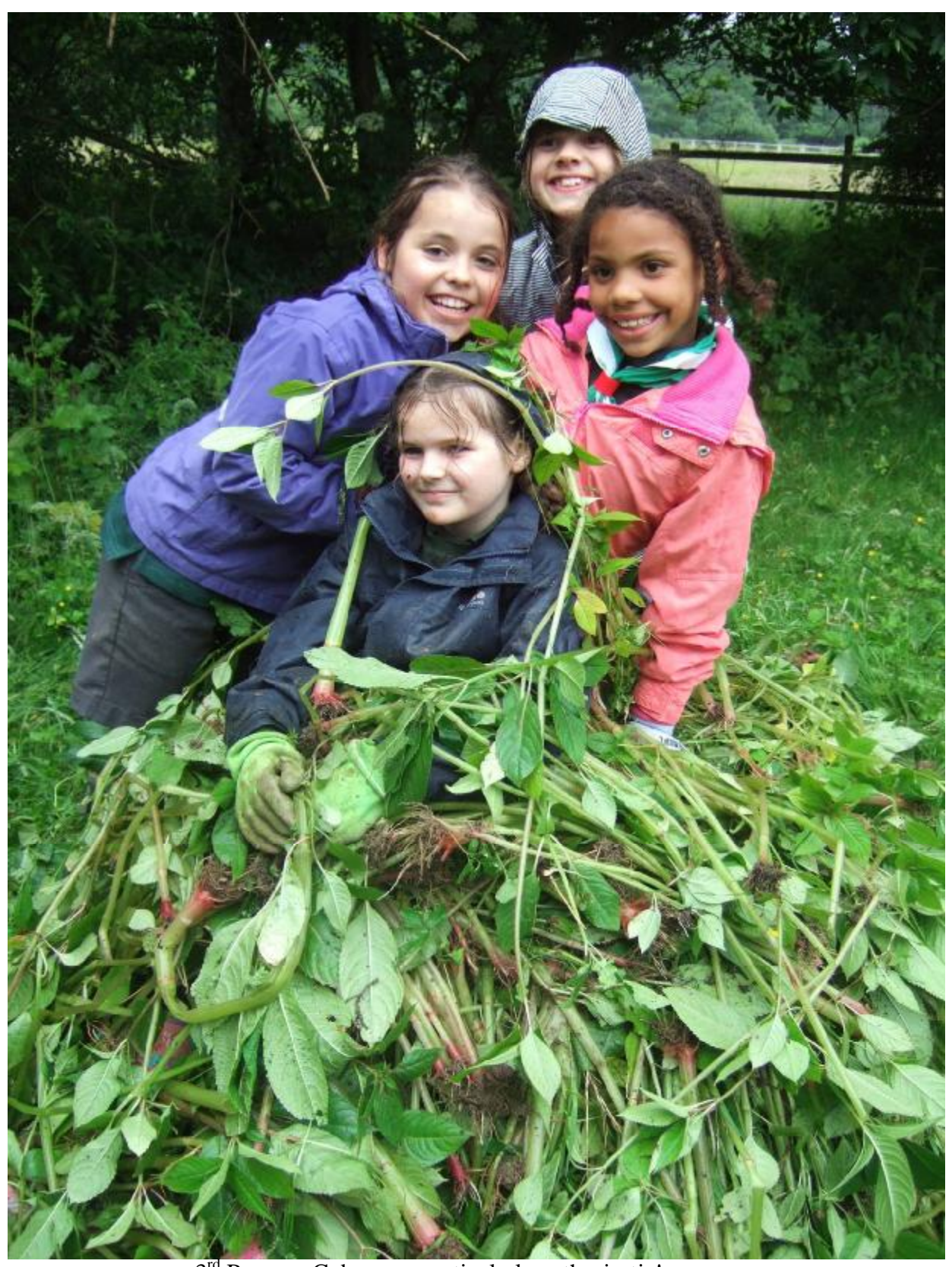
3<sup>rd</sup> Romsey Cubs were particularly enthusiastic!