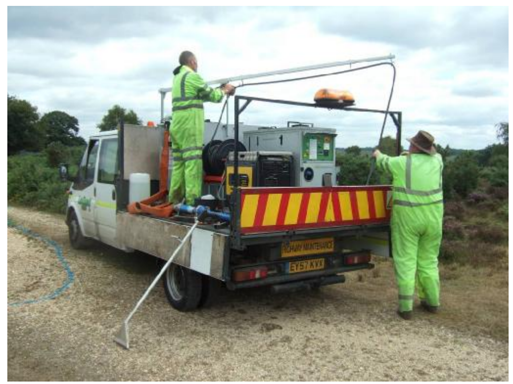
The water was contained in tanks mounted on an 'amenity' vehicle which was significantly smaller than the tractor used during the trials in 2011.