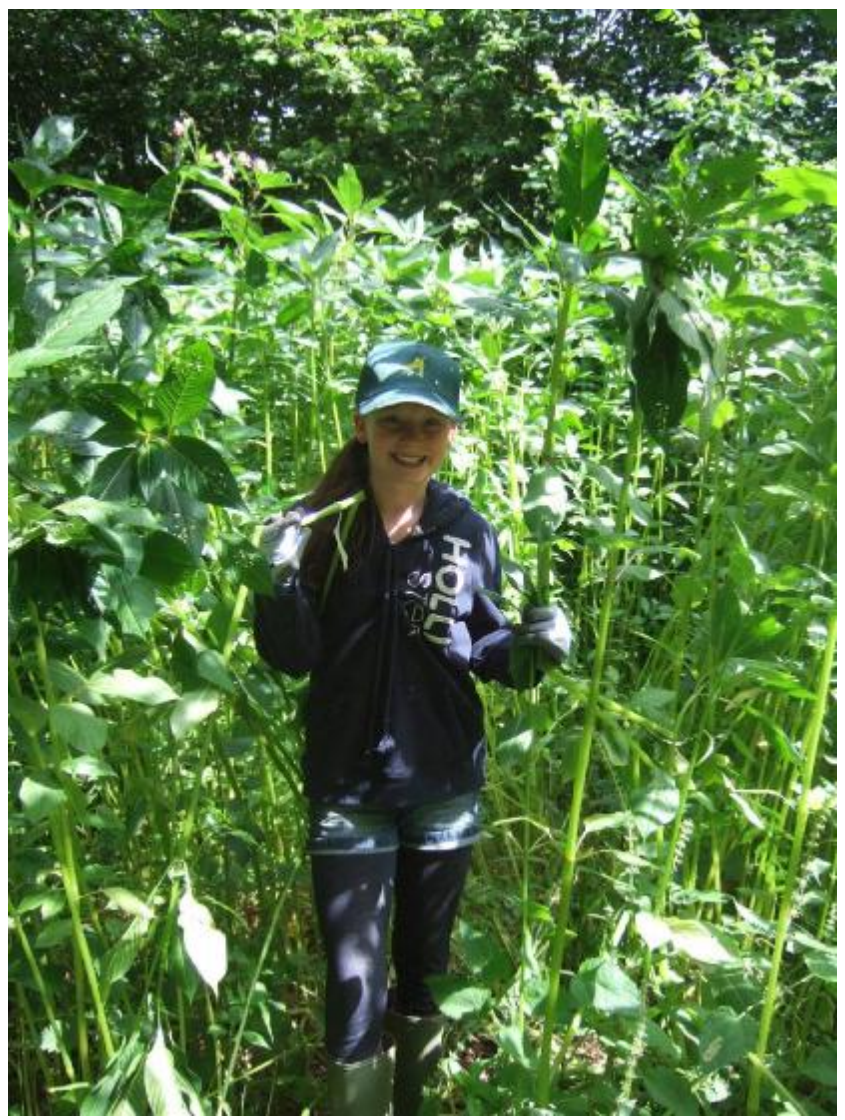
Guides from Brockenhurst who pulled balsam at Fuzzie's Farm along the Cadnam River on Saturday 27 July 2013