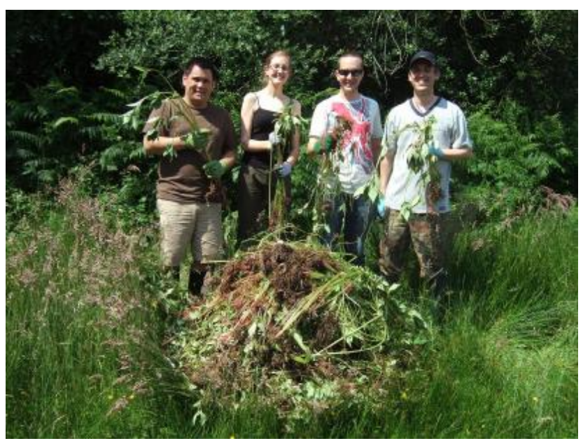
Staff from BMW's Finance Department pulled balsam on the Cadnam River on 25 June 2013

Help came from a wide range of sources including local residents, riparian landowners, Cubs, Scouts and Girl Guides, staff from BMW's Finance Department in Hook, Waitrose partners from their store in Lymington, staff from various teams at the Environment Agency and a member of staff from Lloyds Bank in Ringwood.