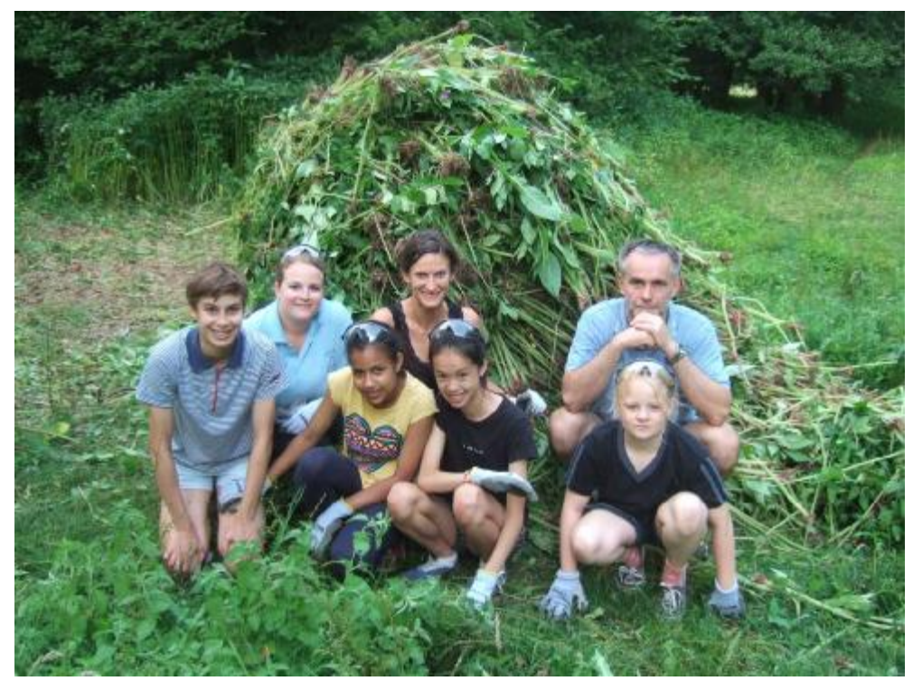
Guides from Southampton with their leaders who pulled balsam along the Cadnam River at Fuzzie's Farm in Newbridge on 16 July 2013