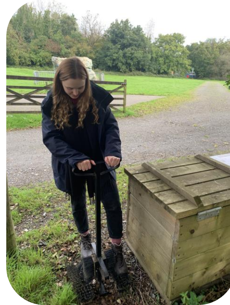
16 boot scrubs to come