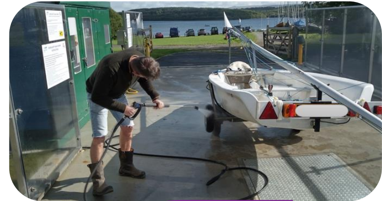
2 new Washdown Facilities