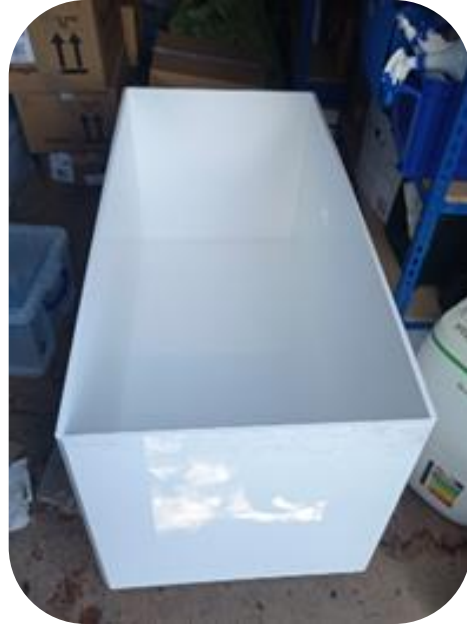
Replacing inner tanks