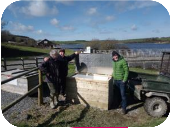
New dip tank installations